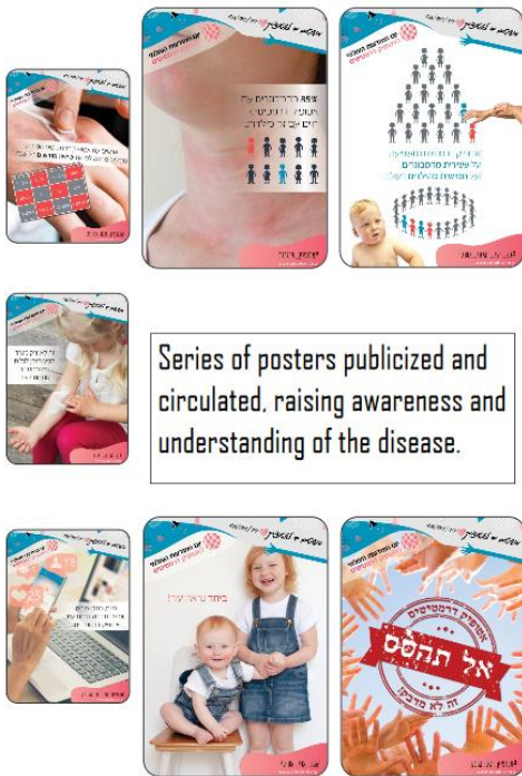
Series of posters publicized and circulated, raising awareness and understanding of the disease.